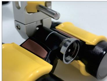
Interface with magnet